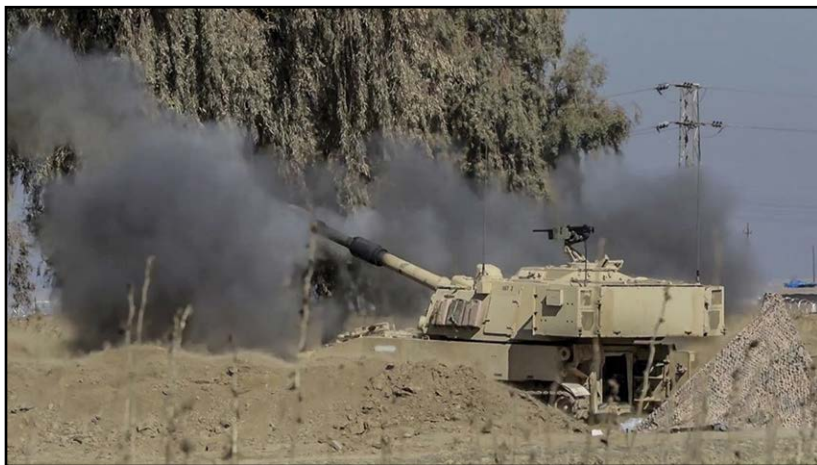
Figure 1-10. Soldiers assigned to the 1st Cavalry Division’s 2nd Battalion, 82nd Field Artillery Regiment, 3rd Armored Brigade Combat Team, fire an M109A6 Paladin from a tactical assembly area at Hamam al-Alil to support the start of ISF’s offensive in West Mosul, Iraq, 19 February 2017.

All variants of U.S. Army mortars were employed in Mosul. With the continued development of mortar precision-guided munitions, there will be essential organic fires that must be incorporated within the greater fire support plan during dense urban terrain operations. Surface-delivered, precision-guided munitions, combined with a complement of joint fires capabilities, afforded the commander maximum flexibility in dense urban terrain.