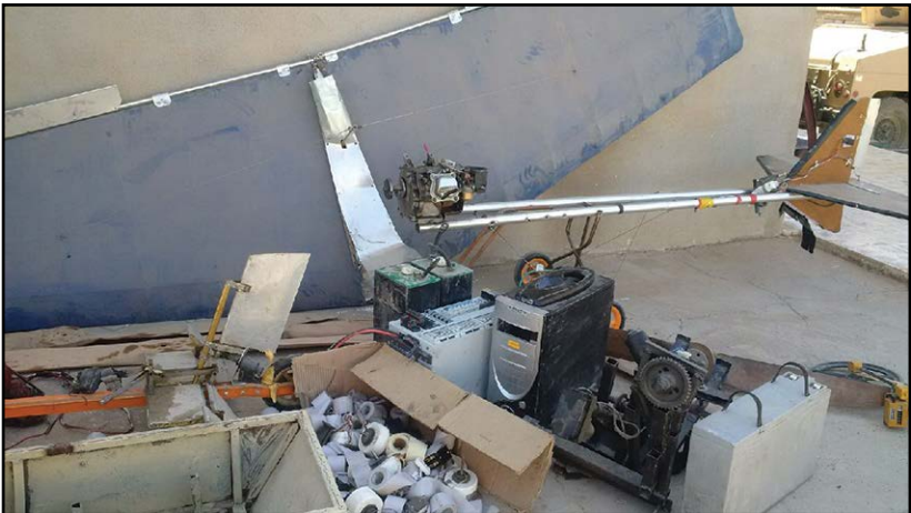
Figure 1-16. Battlefield innovation: ISIS platform fixed-wing unmanned aircraft system

19. Battlefield Adaptation. U.S., coalition, partner, as well as ISIS forces exhibited adaptation on the battlefield. Both ISIS and ISF conducted improvements and modifications to commercially available off-the-shelf technology in support of their forces. U.S. Soldiers demonstrated their ingenuity by improvising a mobile ground-based electronic warfare system. The U.S. Army must be prepared to fight in this fluid environment and empower Soldier ingenuity and experimentation. Moreover, the Army needs an agile and coordinated approach from the military industrial base to understand the opportunities of and technological innovations on the modern battlefield (this would include battlefield circulation). To win, the Army must develop the mechanisms and organizations to innovate faster than its adversaries.