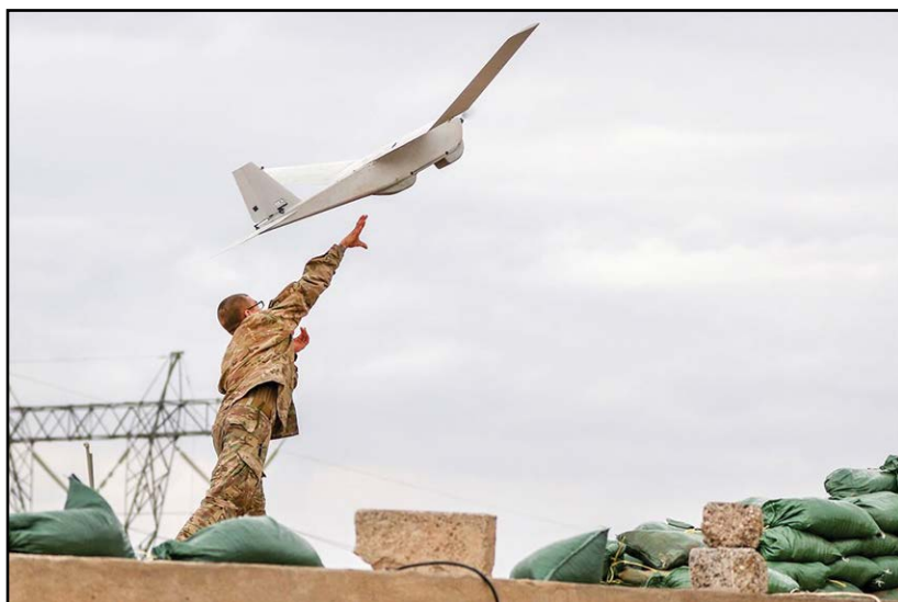
Figure A-3. U.S. Army Soldier launches a Puma unmanned aerial vehicle near Al Tarab during an ISF offensive on an ISIS position near the western edge of Mosul.