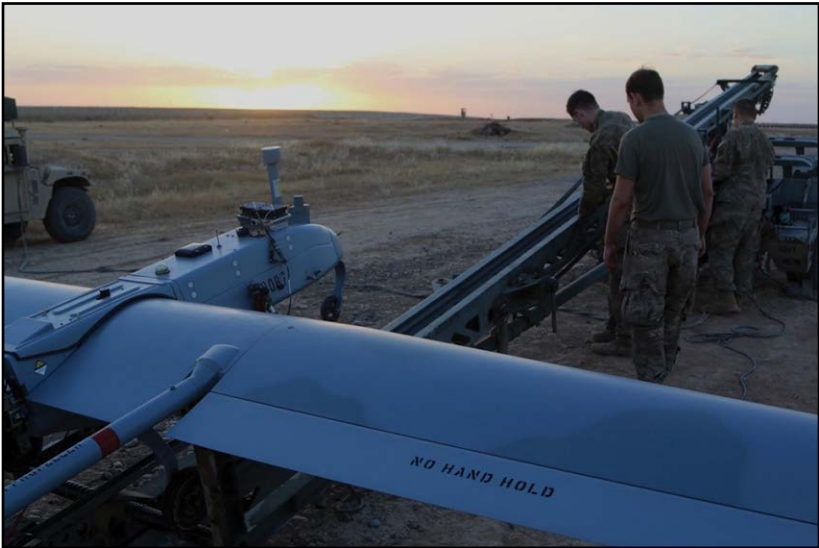
Figure C-5. Soldiers assigned to the 4th Squadron, 6th Cavalry Regiment, 16th Combat Aviation Brigade, prepare to launch a RQ-7B Shadow Tactical Unmanned Aircraft System, 22 May 2017.

9. The Dense Urban Environment Provides Concealment Opportunities to the Adversary That Reduce Current Technological and Firepower Advantages. In Mosul's complex terrain, the ground force commander interpreted the deep fight as starting just blocks away from the current position. This led to an increased concentration on the close fight vice the traditional deep fight and revealed difficulties with the dynamic nature of targeting and network development. This brings into question what defines the close and deep fight in dense urban terrain. In Mosul, this was highlighted in the challenge to the disciplined and effective employment of armed intelligence, surveillance, and reconnaissance platforms (multi-role assets) between the roles of "strike" and "collect." At times, this created friction due to end-user preferences for a specific asset. Dynamic targeting requirements reprioritized platforms, thereby retasking armed remotely piloted aircraft to conduct immediate strikes. This trade-off with the intelligence collection capabilities inevitably reduced network and deep-fight development. Yet, in dense urban terrain and in mid-high intensity combat, dynamic targeting will always be essential.