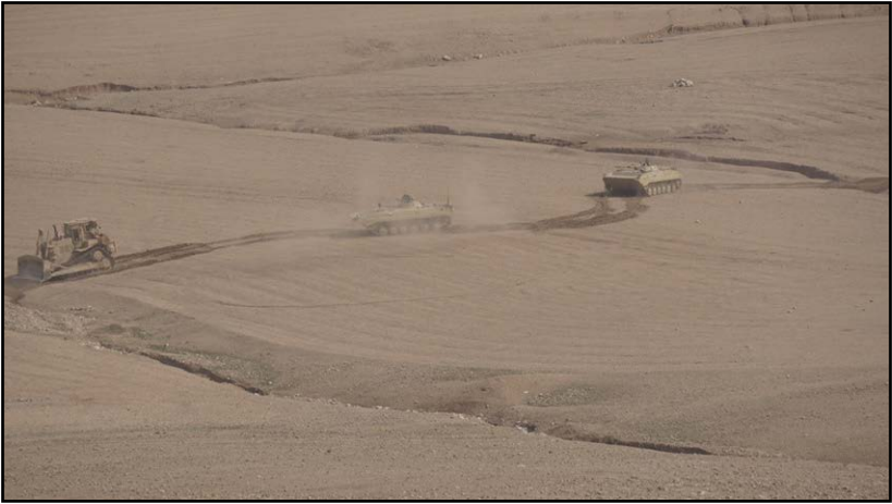
Figure 1-12. A bulldozer and armored personnel carriers from the 37th Brigade, 9th Iraqi Army Division, advance from one objective to the next north of Al Asthana Ridge, 27 February 2017.

13. Internally Displaced Persons. Units must be prepared to contend with internally displaced persons during tactical operations. The government of Iraq executed a plan to accommodate internally displaced persons in conjunction with the United Nations and nongovernmental organizations. Mosul operations are a case study for how handling internally displaced persons must be planned early and comprehensively. USAID's Disaster Assistance Response Team was a key partner in working with the government of Iraq. Even with robust USAID and Iraqi planning, coalition forces still had to prepare for dense flows of internally displaced persons congesting key lines of communication, screening, and checkpoints adjacent to key terrain and nongovernmental organizations operating within the area of operations. Staff and leaders will have to plan for internally displaced persons at some level and should also familiarize themselves with USAID capabilities and how the United Nations humanitarian organizations operate. While the planning and execution rested with the host nation for operations in Mosul, the U.S. Army, as a unified action partner, must be prepared to execute this resource-intensive task in dense urban environments.