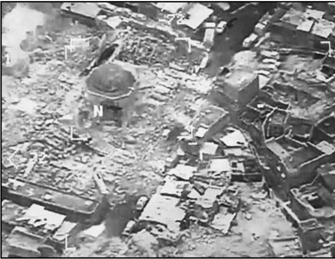
Figure 1-4. Destruction of the Great Mosque of al-Nuri in western Mosul by ISIS, 21 June 2017

Throughout the nine-month Mosul campaign, U.S. Army advise-and-assist teams, alongside joint and coalition special forces advisors, joint forward observers, and joint terminal attack controllers, played critical roles in the planning, coordination, and execution of operations with their Iraqi Army and security forces partners. Given the unique challenges of Mosul's dense urban environment and confronting a capable and adaptive adversary in ISIS, advisors enabled and deconflicted a complex array of air and ground joint fires as well as intelligence, surveillance, and reconnaissance assets that made victory expedient and possible. Experiences in Mosul reaffirmed that urban terrain strengthens the defense and therefore required a combined arms approach to warfare. Both ISIS and Iraqi forces demonstrated a willingness and proficiency to adapt in a complex environment by using commercial off-the-shelf technology as an asymmetric advantage. Mosul revealed that a determined and adaptive partner, empowered with the unique capabilities provided by capable advise, assist, accompany, and enable teams, can defeat a determined and adaptive adversary.