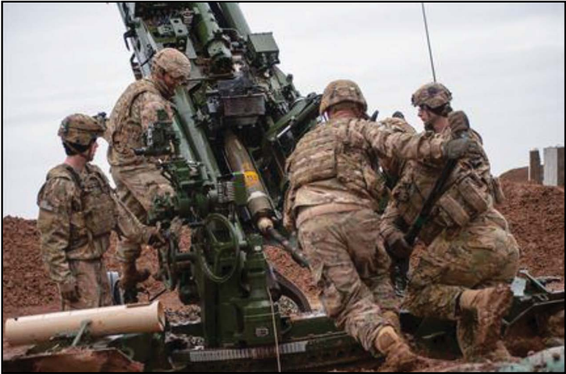
Figure C-1. Soldiers from Battery C, 1st Battalion, 320th Field Artillery Regiment, Task Force Strike, load a round into an M777 artillery piece to support ISF during the Mosul counter offensive in northern Iraq, 24 December 2016.

The urban environment is among the most complex multi-dimensional terrains in the world. During Operation EAGLE STRIKE, a nine-month campaign in the ISIS-held city of Mosul, U.S. and coalition partners conducted an aggressive, unrelenting campaign with Iraqi security forces (ISF) as the lead maneuver force. Ultimately, ISF reclaimed ISIS-held territory, backed by coalition advise-and-assist teams who leveraged an expansive network of intelligence, surveillance, reconnaissance, joint fires, sustainment, and medical capabilities.