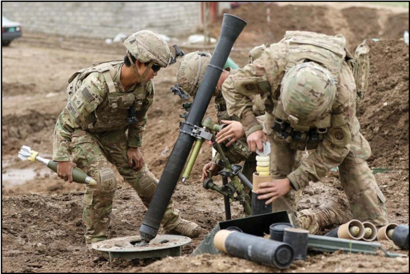
Figure 1-9. Army mortarmen, assigned to the 2nd Brigade Combat Team, 82nd Airborne Division, prepare for a fire mission in support of the 9th Iraqi Army Division near Al Tarab, 18 March 2017.

9. Precision Fires. Excalibur and Guided Multiple Launched Rocket System precision-guided munitions were used routinely in this low collateral damage estimate environment. Precision effects and time to target appeared to be the same for both, given common conditions.