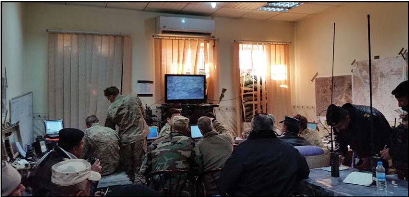
Figure 1-5. Combined command post (Mosul Study Group, 2017)

This topic needs to be examined from a mission command perspective at all echelons. Different imagery databases resulted in inefficiencies and suboptimal combat effectiveness. The U.S. Army needs a shared and accessible common operating picture to enable dynamic targeting and visualization with joint, coalition, and multinational partners.