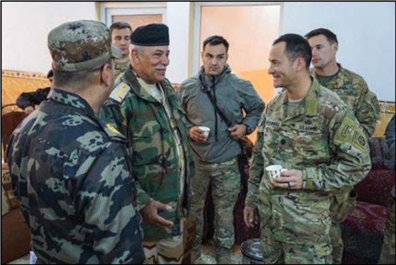
Figure B-1. U.S. Army advisor (right) speaks to a 9th Iraqi Army Division brigade commander before a review of the division's concept of operations for the upcoming battle to liberate West Mosul, 17 February 2017.

1. Understanding Partner Military Culture. Security force assistance requires a thorough understanding of the partners' doctrine, how they fight, and why they fight. Advisors in Mosul had to be cognizant of their partners' internal and external influences, how mission command is implemented, and how the partner leaders' decision-making process works. Strategic and historical culture, military tradition, unit sub-culture, strategic and historical culture, tactical leadership (particularly the strength of the noncommissioned officer corps and the role of junior officers), familial relationships, education levels, individual partners' aspirations and motivations, and religion are examples of key considerations for the advisor. Successful advisory missions require continuity; deep cultural knowledge is developed over time and must be passed deliberately during unit transitions. Successful advisory missions also require persistent attention to the relationship. This was particularly important on the "bad" days, where assurance kept the relationship sound. Assurance was a part of a daily battle rhythm for coalition forces supporting the advise, assist, accompany, and enable mission. Operating and continuously living with partners (shared hardship) demonstrated commitment and is seen as a best practice for assurance.