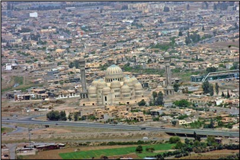
Figure 1-1. Mosul, Iraq, 06 April 2008

Over the next year, Iraqi forces would reorganize, train, equip, and prepare to retake the city. Iraqis learned valuable tactics, techniques, and procedures in the successful campaigns in Tikrit (April 2015), Ramadi (March 2016), and Fallujah (June 2016). Mosul was the last significant ISIS urban area in Iraq. At the start of the battle to liberate Mosul in October 2016, ISIS maintained a light infantry force of approximately 3,000 to 5,000 in the city with significant numbers of heavy machine guns, rocket-propelled grenade launchers, recoilless rifles, mortars, and rockets. ISIS forces constructed an elaborate series of defensive works inside the city, fortifying buildings, blocking avenues of approach, creating obstacles, and constructing underground shelters and tunnels.