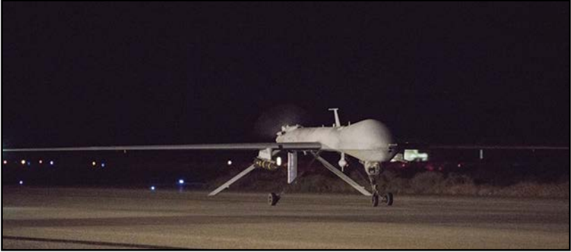
Figure 1-6. An MQ-1B Predator taxis in after completing a combat mission 01 July 2017

4. Preparing for Decisive Action. Mosul presented U.S., coalition, and partner forces with the particularly challenging problem of conducting combined arms operations in a dense urban environment that restricted maneuver, command and control, effectiveness of fires, and the effective range of weapons. The city's narrow streets and corridors, rubble, power lines, and unforeseen environmental hazards all negatively impacted mobility and the ability to maneuver. Dense urban terrain aids the conduct of the defense against a superior force and affects the tempo of the attacker. Tempo and timing may be just as important as mass in future urban assaults. U.S. forces must learn faster than their adversaries in order to create opportunities. The U.S. Army must integrate intelligence, surveillance, reconnaissance, maneuver, and precision fires at echelon to overwhelm the defender and create gaps to exploit. Making these adaptations accessible to coalition partners increases the probability of a breakthrough. Operation EAGLE STRIKE demonstrated that the U.S Army must continue to train at echelon in dense urban conditions to understand the complexities of decisive action in unified land operations. In Mosul, the coalition had to contend with simultaneous execution of offensive, defensive, shaping, and stability tasks.