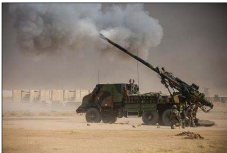
Figure C-6. French soldiers conduct a fire mission in support of ISF's advance toward Mosul, 17 October 2016. The support was provided by the Caesar truck-mounted artillery.

10. Understanding National Caveats. It is imperative that commanders and their staffs understand broad operational constraints placed on coalition assets by their governments. This will improve asset-target pairing during targeting. In order for certain countries to engage targets, specific criteria must be met (i.e., some coalition members can only fire ground artillery if in a defensive situation). To improve this understanding, coalition representatives were physically located within the CJOC headquarters and CAOC.