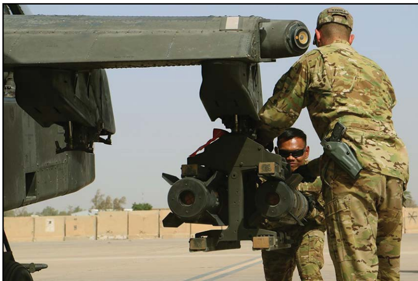
Figure 1-8. Soldiers slide a Hellfire missile into place on an AH-64 Apache attack helicopter in Iraq.

8. Surface-to-Surface Fires. Artillery, rockets, and mortars were effectively and continuously employed by advise-and-assist teams to protect coalition and partner formations (counterfire) from ISIS indirect fires and to deliver timely, accurate, and precision effects in support of maneuver. The close fight required detailed planning to integrate and deconflict surface fires with aerial platforms. Counterfire in the dense urban environment required meticulous planning, with an emphasis on intelligence preparation of the battlefield (understanding the physical environment) and predictive and pattern analysis. In dense urban terrain, counterfire radar systems were cued with other intelligence, surveillance, and reconnaissance systems, such as MQ-1 and MQ-9, to be effective. Guided Multiple Launched Rockets, mortars, and cannon artillery were highly effective in the dense urban environment when positioned with the correct gun-target line and range. As the only organic, accurate, and all-weather capability, surface-to-surface fires employment in Mosul involved a degree of evolving art that requires further study.