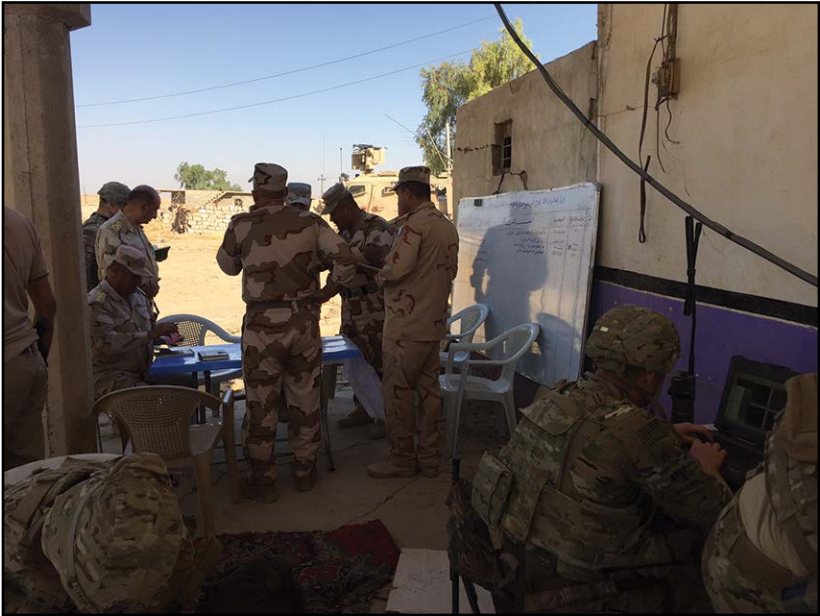
Figure 1-7. Combined command post

7. Munitions. The Battle of Mosul provides a unique data set to examine the availability, utilization, rate of expenditure, subsequent effects, and limitations with regards to the full spectrum of munitions used (air- and surface-delivered). In Mosul, supply chain availability, utility of munition type, tactical accessibility, and battlefield dynamics affected tactical decisions to select and deliver munitions. There are open questions whether current air- and surface-delivered munitions and advanced weaponeering procedures were fully optimized for targets in dense urban terrain. Further study is needed to determine whether the families of munitions (ground and air) meet the unique characteristics that dense urban terrain presents (multi-floor structures consisting of high-strength concrete, dirt, reinforced steel, attack angle, attenuation and amplification characteristics, etc.).