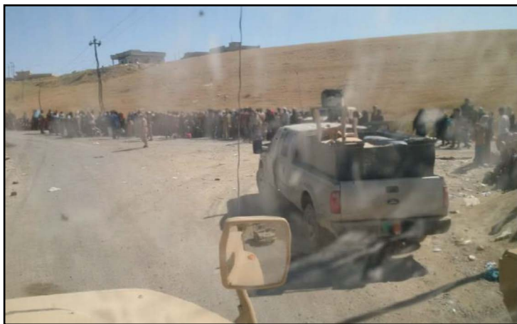
Figure 1-13. Mosul internally displaced persons

14. Assured Power. Assured power was a critical pacing item in Mosul. Commanders and staffs must understand their power generation requirements based on the variety of equipment found within their unit. For expeditionary operations, the Army needs flexible and scalable assured power options that are more deployable, mobile, quiet, and easy to repair. The Army needs to re-examine tactical assured power, starting with the family of tactical generators. The Army also needs to better understand what expeditionary units require when conducting distributed operations in an austere and nonpermissive environment beyond forward operating bases.