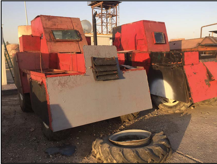
Figure A-4. ISIS VBIED