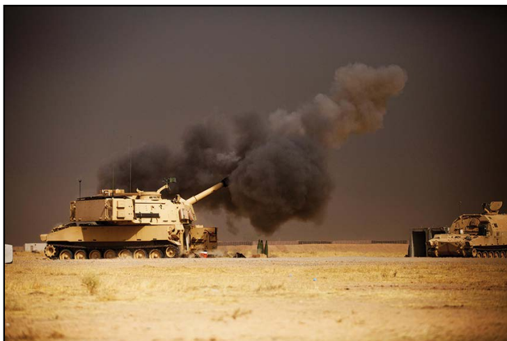
Figure C-2. M109A6 Paladin conducts a fire mission at Qayyarah West, Iraq, in support of ISF's push toward Mosul, 17 October 2016.

The observations and information gathered here focused primarily at the tactical level, below the division (combined joint force land component command [CJFLCC]). 1 Observations and conclusions gained at the division and above are best suited for a more deliberate study. Insights from the combined joint task force (CJTF) 2 and U.S. Central Command Combined Air Operations Center (CAOC) helped in the development of this appendix. This appendix is solely directed at the operations in Mosul and may not necessarily be applicable in current operations.