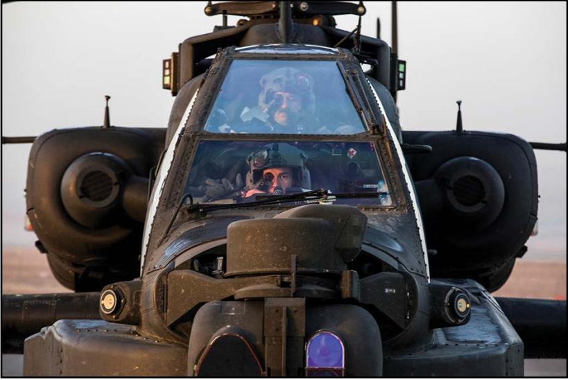
Figure C-4. Bravo Troop, 4th Squadron, 6th Cavalry Regiment, Task Force Saber, conduct preflight on an AH 64E Apache helicopter at Camp Erbil, Iraq, 10 January 2017.

Both the terrain and ingenuity of the enemy taking complete advantage of the environment — leveraging angles to their advantage and masking their fires — tested counterfire operations in dense urban terrain. Thus, radar operators had to develop a solid understanding of enemy tactics, techniques, and procedures to conduct better predictive analysis during counterfire operations. The enemy use of “mouse holes,” where fighters would knock holes in rooftops and sides of buildings, while also knocking down interior walls between structures (think row houses), allowed them to move freely in newly created hollow and interior building spaces. This created new challenges as target location error would rise when trying to determine an accurate point of origin. This had immediate impact on collateral damage estimates when generating counterfire and strike requests.