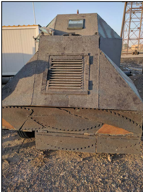
Figure A-5. ISIS VBIED