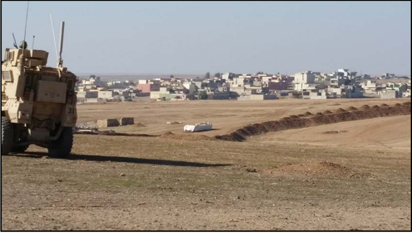
Figure 1-3. Defensive berm, East Mosul

On 01 November, Iraqi forces entered the city and began clearing the Karama and Gogjali districts, pushing west toward the University of Mosul. The fighting was bitter and Iraqi operations were impaired by poor weather, which slowed the Iraqi advance and diminished the effectiveness of U.S. and coalition air support and reconnaissance. By the end of November, the 15th Iraqi Infantry Division advanced north along the west bank of the Tigris and closed within several kilometers of West Mosul. By mid-December, Iraqi forces, led by the Counter Terrorism Service and its partner coalition special operations forces, began to focus on the University of Mosul complex and took control of the area on 13 January. To the south, additional elements of the Counter Terrorism Force and the Federal Police (Emergency Response Division) advanced to the Tigris, seized crossing sites, and cut ISIS lines of retreat. On 24 January 2017, Prime Minister Abadi announced that Iraqi forces had liberated East Mosul. While Iraqi forces eliminated the last pockets of resistance, the reconstituted local police and vetted militia formations established local security and governance to support reconstruction efforts.