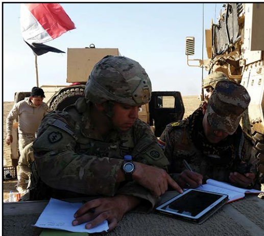
Figure 1-14. Combat advising