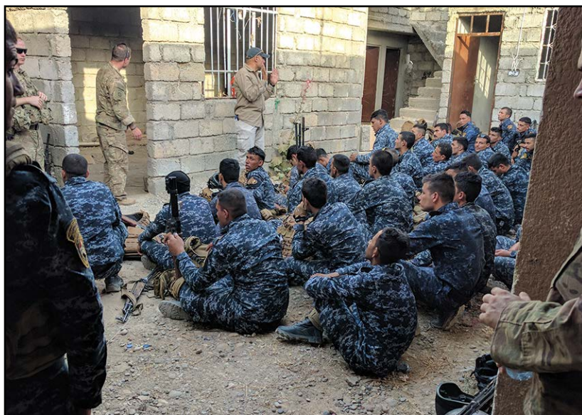
Figure 1-15. Combat skills enhancement between fighting

17. Security Force Assistance Condition Setting. Security force assistance is more than (institutional) force generation and meeting partners for planning and execution. Setting conditions for partner operations is equally important in security force assistance as is combat advising and building partner capacity. Operation EAGLE STRIKE security force assistance lead-up activities included critical actions such as establishing temporary assembly areas, opening lines of communication, and establishing mission command architecture. In many ways, this is akin to the U.S. doctrine of setting the theater. In Mosul, advisory teams were also partnered with elements (Iraqi Federal Police) that had not gone through the Iraqi Army training pipeline, but were a key component of the partner's campaign. Security force assistance units must have a holistic view of partner support. Setting conditions is vital to ensure success from force generation, institutional development, fielding units, and, ultimately, operations with partners.