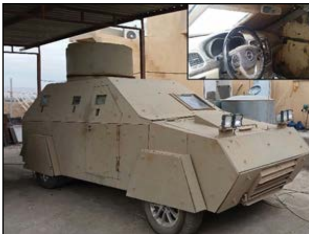
Figure 1-2. ISIS VBIED

In early 2016, ISF began the planning and preparation for the liberation of Mosul, which involved complex negotiations with U.S. forces, coalition partners, the Kurdish Regional Government, provincial governors, multiple Iraqi government ministries, and Iraqi government-supported militias. Learning from the liberations of Ramadi, Tikrit, and Fallujah, U.S. and Iraqi military planners agreed that Shi'a militias and Kurdish Peshmerga would assist in the isolation of ISIS forces but remain outside Mosul. Iraqi forces took the lead in operational planning and execution of operations while U.S. and coalition forces advised, assisted, accompanied, and enabled ISF throughout the battle.