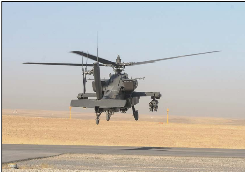
Figure 1-12. An AH-64E Apache helicopter from the 4th Squadron, 6th Cavalry Regiment, Task Force Saber, hovers prior to taking off to conduct a mission, Erbil, 11 July 2017.

12. Bulldozers. Armored bulldozers led the advance of Iraqi maneuver forces as an essential element of a combined arms formation and provided a protective capability in hasty defense. Armored bulldozers provided Iraqi forces breaching, mobility support, and clearance capabilities and became an ISIS high-value target. In Mosul, heavy engineer platforms were vital and created a significant conundrum for the adversary.