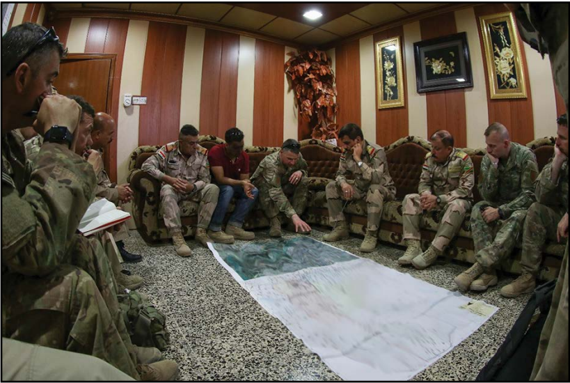
Figure B-2. U.S. Army and ISF leaders discuss operations at a shared headquarters in Mosul, Iraq, 08 June 2017.

7. Unity of Security Force Assistance Efforts. Combat advisors require an understanding of their partners' intent and awareness of other interests with other entities (including organizations, political parties, and national interests). This brings a greater level of complexity to advising and, therefore, mission planning must take into account all the forces operating within the battlespace. The primary ISF were partnered with a variety of coalition partners. These partners aligned with the CJFLCC-I and SOJTF-I organizations that shared battlespace and enabling assets, and occasionally were co-located together. When special operations and conventional forces' security force assistance efforts were synched and mutually supportive, all parties benefited from the interaction. Mission planning must take into account all forces operating within the battlespace. This leads to effective interdependence, integration, and interoperability when advisors become familiar with the unified action efforts in the area of operations. Consideration must be given to the importance of sharing information, intelligence, atmospherics, and lessons across security force assistance efforts.