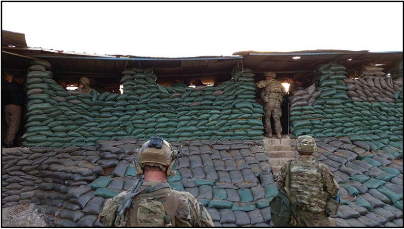
Figure A-1. Tactical assembly area

In addition to being time consuming, seizing and retaining terrain in Mosul was manpower and resource intensive. Throughout operations in Mosul, coalition and ISF formations occupied a series of urban patrol bases that could be moved at any time. These patrol bases consisted of sandbagged fighting positions. Weapon systems overwatched key avenues of approach. Accompanying sector sketches were initially hand drawn and later digitally uploaded. It was necessary to tie these positions in with mortars, anti-armor weapons, and claymores because the flanks and rear are always vulnerable in dense urban terrain's 360-degree battlefield.