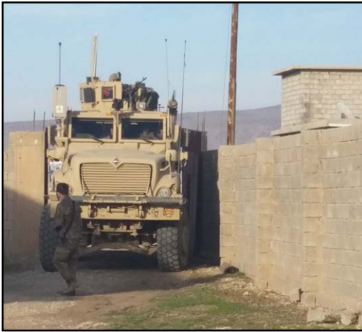
Figure A-2. Restrictive terrain: patrol base entrance

During Operation EAGLE STRIKE, the coalition and ISF were able to identify ISIS command posts through the use of a variety of intelligence collection means. The congested nature of the electromagnetic spectrum (EMS) environment in dense urban terrain can provide a level of concealment to all parties. However, all friendly, enemy, and noncombatant electronic and human activity create some form of observable signature. This creates the opportunity for exposure and collection. One can safely assume that U.S. command posts, with their large digital signatures, are at least as susceptible to detection and collection.